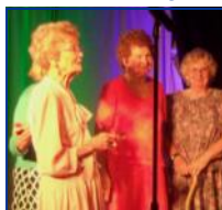
Agape Award Recipients: Walled Lake Church of Christ Pie Social Ladies