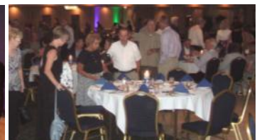
Hundreds attend the milestone celebration!