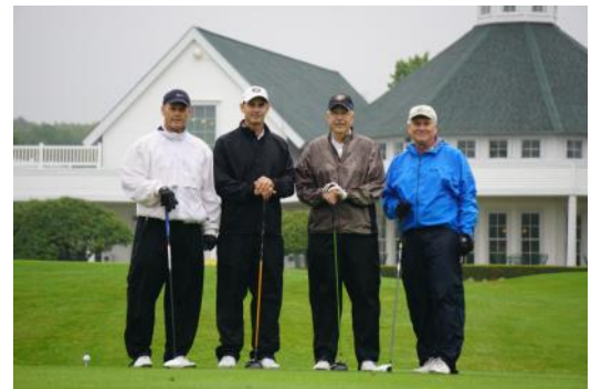
2016 First Place Team—Low Score

True to the past few years, our Golf Classic was ... memorable! A little rain and wind did not dampen spirits as we had our highest number of golfers with 112. These brave men and women had a great time and raised more than $10,000 as group. We look forward to seeing you all again next year on September 16, 2017!